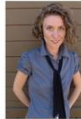
HOST GERTIE OK